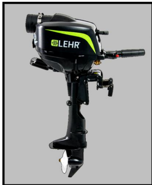
LEHR 2.5 HP MODEL