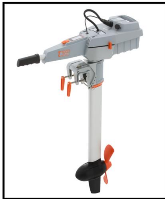
TORQEEDO MODEL "TRAVEL 1003"

In both engine families, there is a fairly large range of power available at, naturally, a rapidly increasing expense.